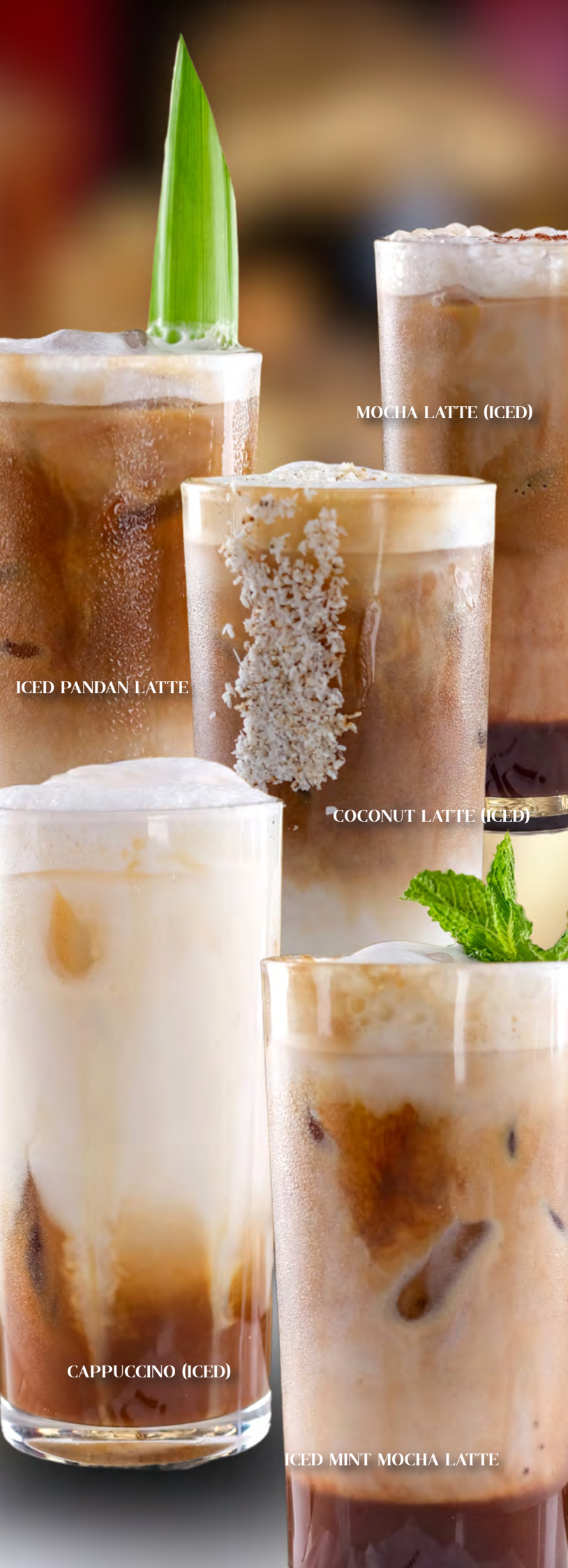
MOCHA LATTE (ICED)