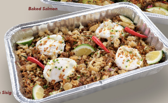
Cast Iron Sisig