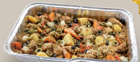
Cheesy Baked Caldereta

Mango Sticky Palitaw 1,050 Pineapple Basil Loaf 1,625